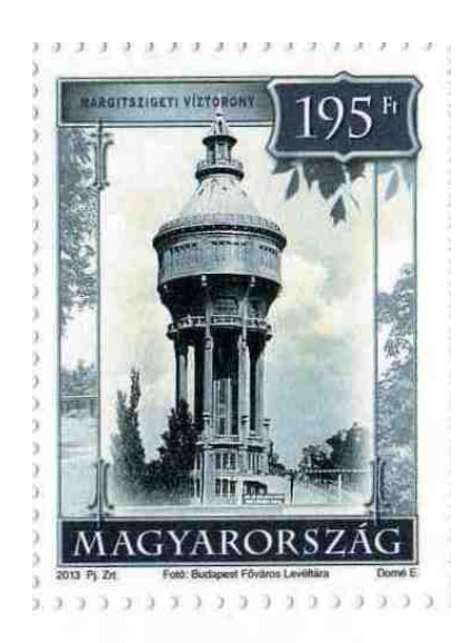
75 ÉVES BUDAPEST XIII. KERÜLETE

Magyar Posta's series of regular postage stamps on Tourism has been expanded by a new stamp depicting the Water Tower on Margaret Island. The interesting feature of the stamp is that the 75<sup>th</sup> anniversary of Budapest's District XIII is marked by an inscription on the selvage of the sheet. The new stamp was designed by the graphic artist Eszter Domé and printed by the banknote printing company Pénzjegynyomda . The photographic material necessary for the stamp was made available by the Budapest City Archives.